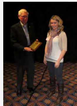
Les Donnelly Scholarship winner

Many of these students have taken courses through our organization and some are working towards becoming Canadian Registered Safety Professionals in the future. We are excited to see where their success will take them!