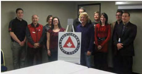
Founding members of ESTP along with Safety Council staff

Another significant event was the official transfer of the Early Safety Training Program over to the Saskatchewan Safety Council. The Early Safety Training Program, founded in southeast Saskatchewan in 1996 by a committee of individuals and organizations, is designed to provide youth with basic, industry recognized safety training at an affordable cost before entering the workforce. Key partnerships with the existing committee and WorkSafe Saskatchewan allowed this valuable program to be expanded to the entire province and established a solid foundation to this promising program.