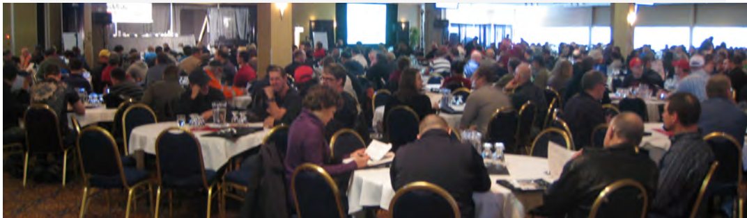
Delegates wait for the next keynote session at the 40th Industrial Safety Seminar

The landmark 40th Annual Industrial Safety Seminar, held in Regina on February 4th, 5th and 6th, expanded our reputation as the premier industrial safety event in Western Canada. Delegates from all across North America were met on the show floor by a wide variety of displayers showcasing the latest in safety products and services.