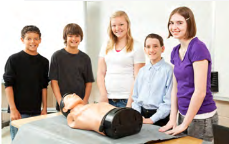
First Aid/CPR is one of the courses offered in Next Generation Boot Camps

Another significant event was the official transfer of the Early Safety Training Program over to the Saskatchewan Safety Council. The Early Safety Training Program, founded in southeast Saskatchewan in 1996 by a committee of individuals and organizations, is designed to provide youth with basic, industry recognized safety training at an affordable cost before entering the workforce. Key partnerships with the existing committee and WorkSafe Saskatchewan allowed this valuable program to be expanded to the entire province and established a solid foundation to this promising program.