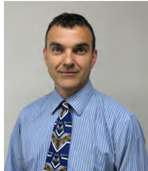
President Saskatchewan Safety Council